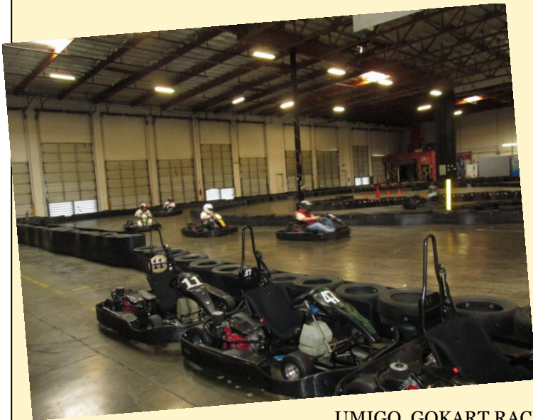
UMIGO GOKART RACING