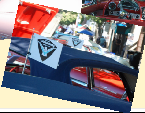
HOT DANVILLE NIGHTS