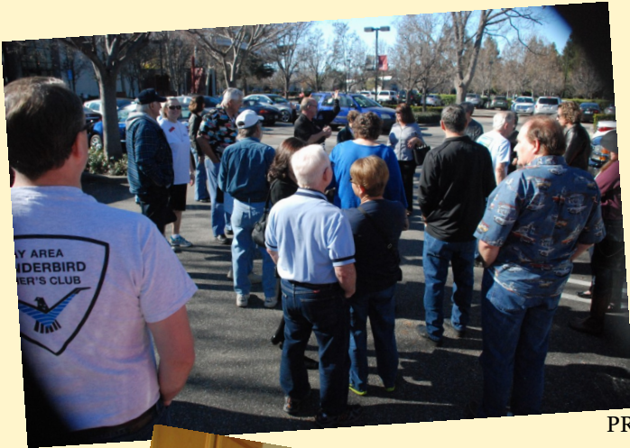
PRESIDENT'S MYSTERY TOUR