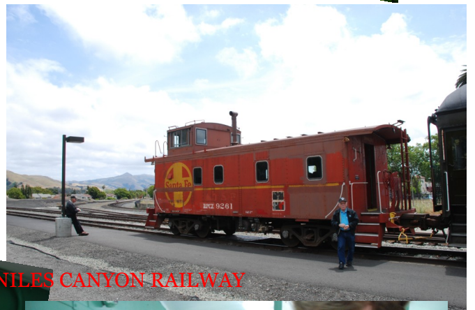
NILES CANYON RAILWAY